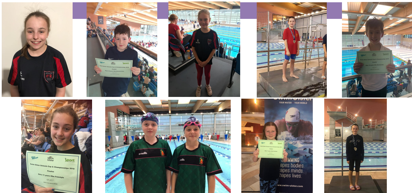
Some of the swimmers who took part in Swim Ulster Irish Minor Schools Meet on 12 th -13 th of October 2019